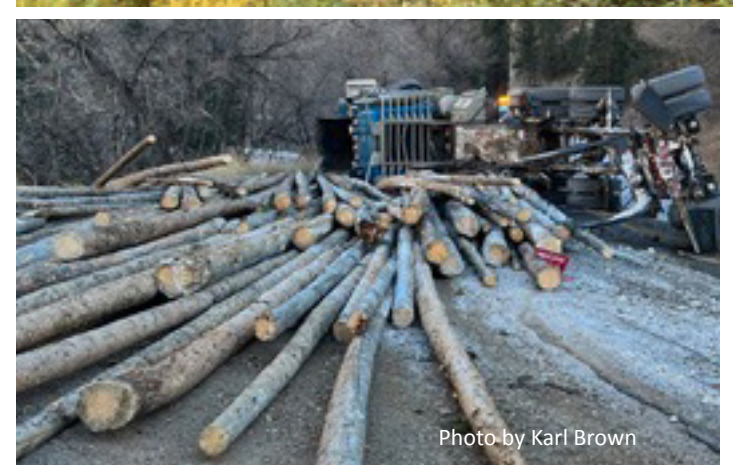
The first call of the new year was a logging truck that turned over in the Lower Poudre Canyon. No one was hurt.